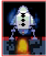
MDM-1 Attack Ship